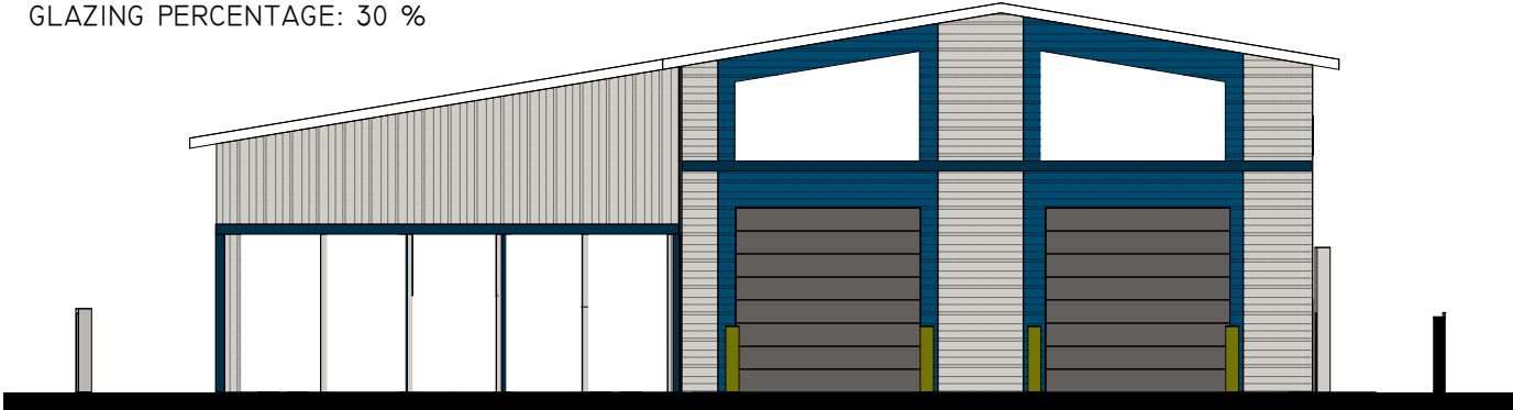
7 SOUTH ELEVATION GLAZING

GLAZING OVERALL FACADE: 1,836 SF GLAZING: 560 SF GLAZING PERCENTAGE: 30 %