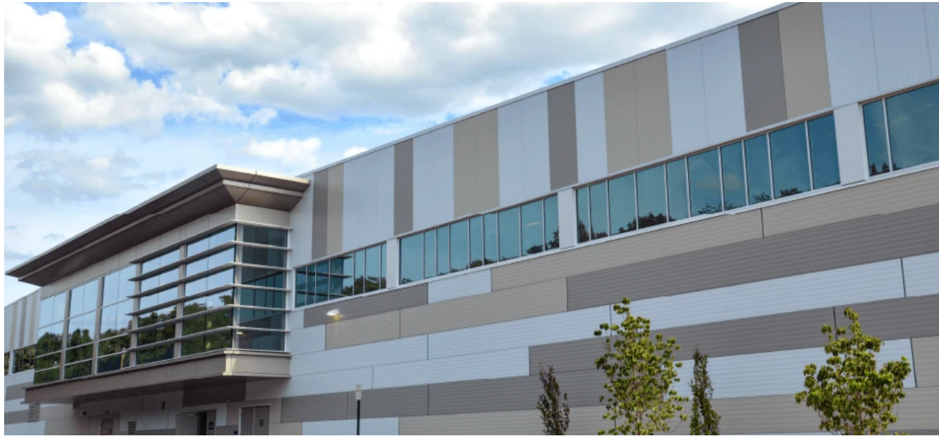
FACADE CLADDING REFERENCE